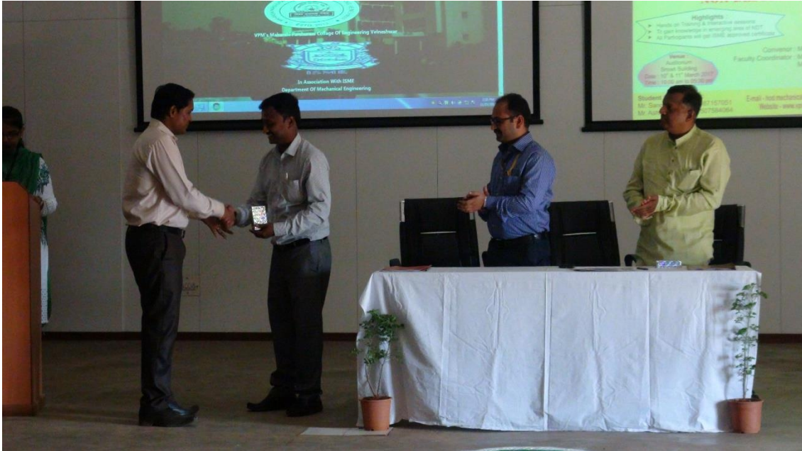
Workshop on ‘Non-destructive testing. (10 th March 2017)

This workshop was organized by department of Mechanical Engineering on 10 th March 2017.