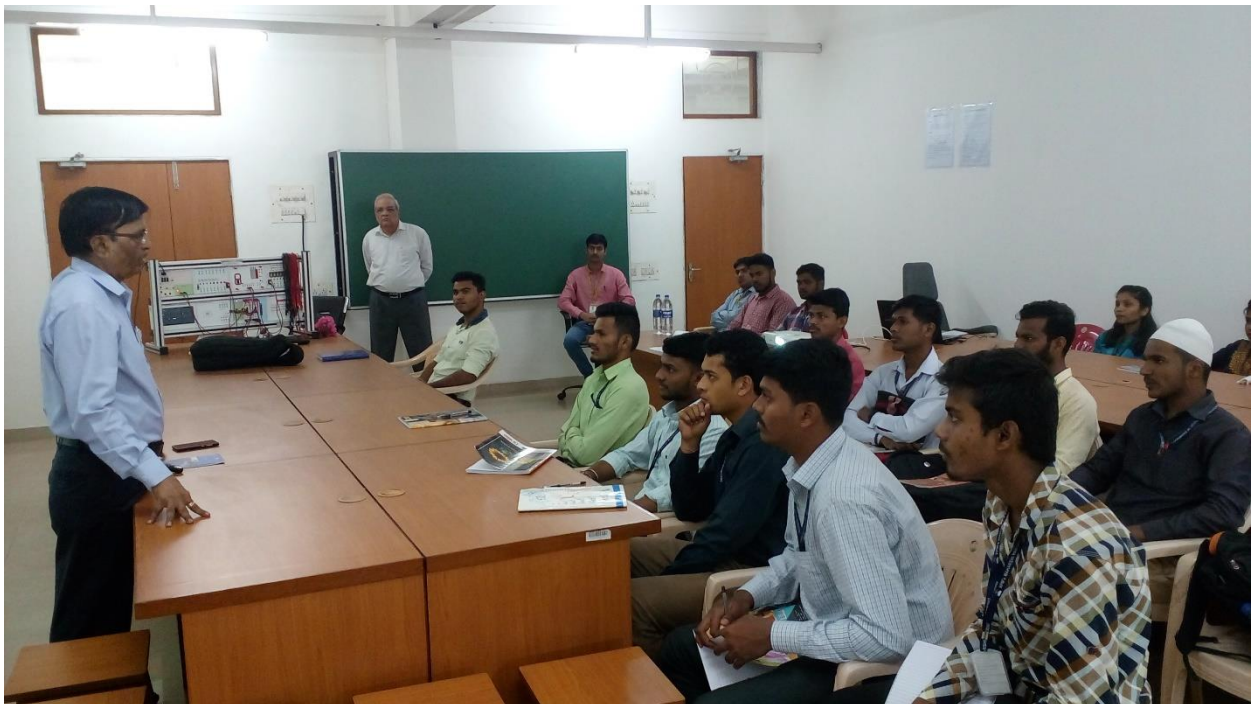
During actual session